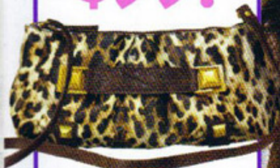
fun leopard prints