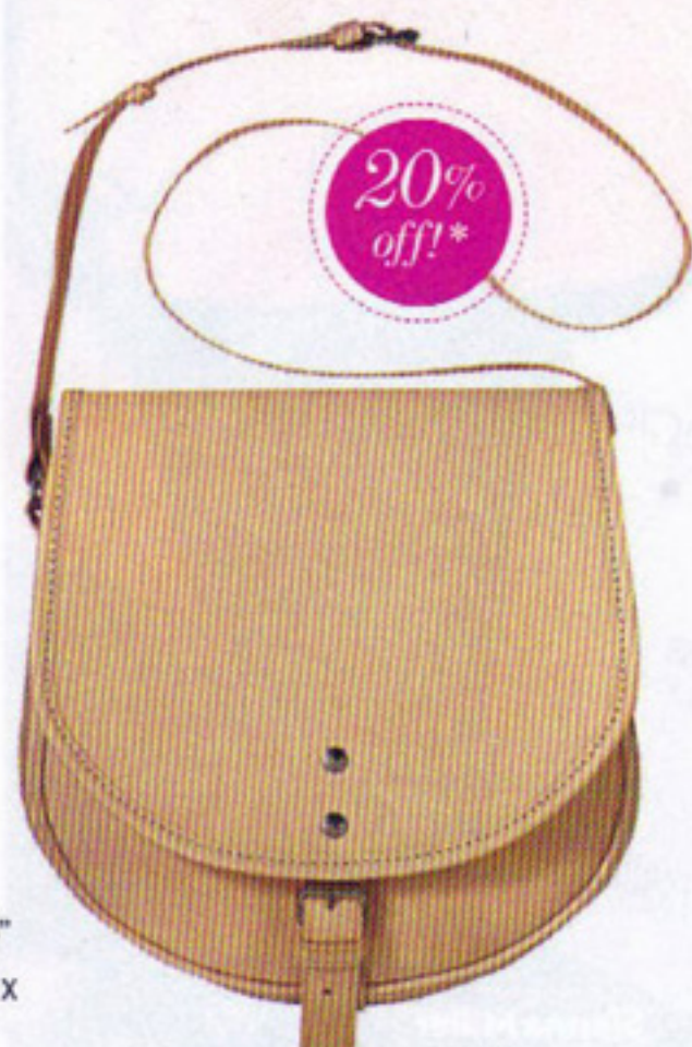
Swedish Hasbeens Leather bag, 10"H x 10"W x 3"D, $365; Rube, 631-267-6117