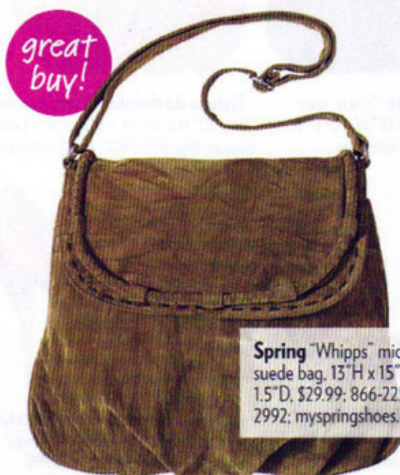
Spring "Whipps" micro suede bag, 13"H x 15"W x 1.5"D. $29.99; 866-225-2992; myspringshoes.com