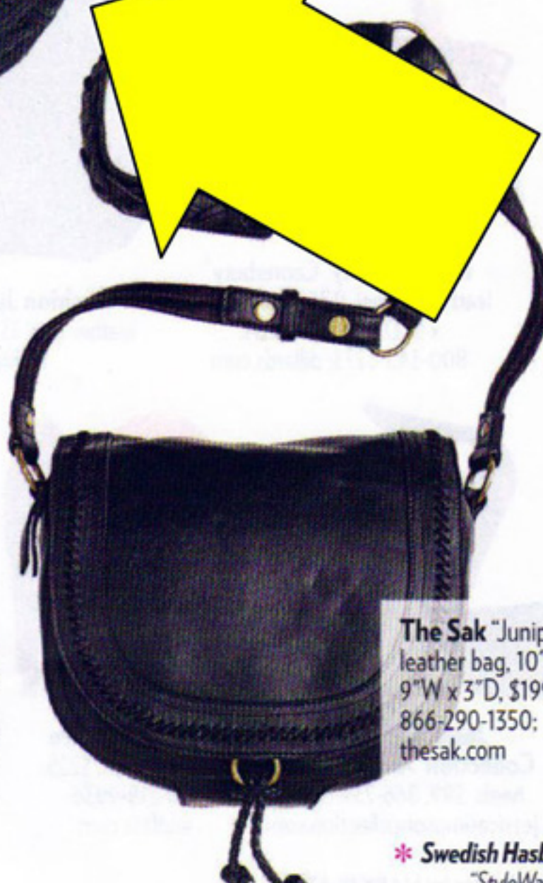
The Sak "Juniper" leather bag, 10"H x 9"W x 3"D. $199; 866-290-1350; thesak.com