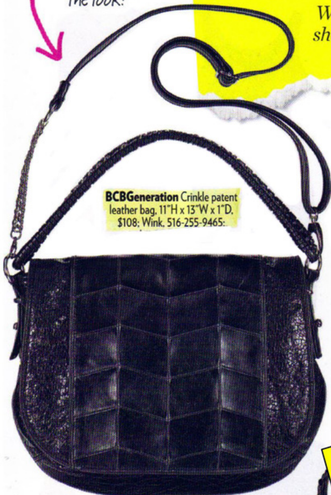
BCBGeneration Crinkle patent leather bag, 11"H x 13"W x 1"D. $108; Wink, 516-255-9465.

Wear yours long and swingy for a retro feel, short for a more polished take or across your body for a relaxed vibe