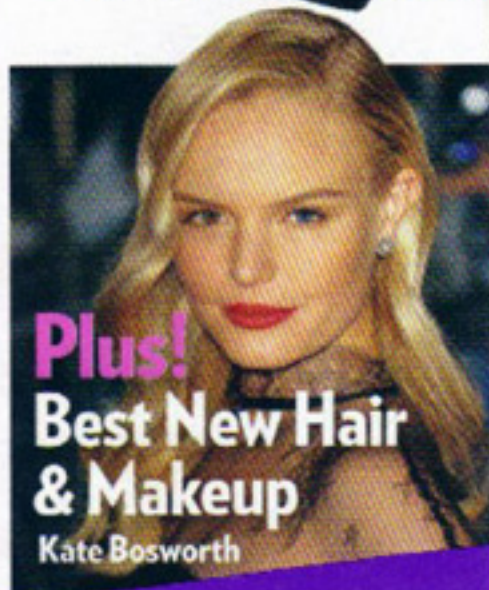
Plus! Best New Hair & Makeup Kate Bosworth

438 NEW FALL LOOKS! Cool Bags * Flattering Tops * Sexy Shoes