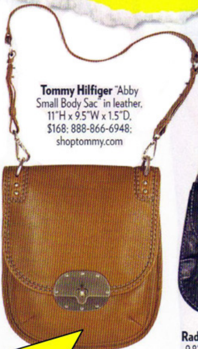
Tommy Hilfiger "Abby Small Body Sac" in leather, 11"H x 9.5"W x 1.5"D. $168; 888-866-6948; shoptommy.com