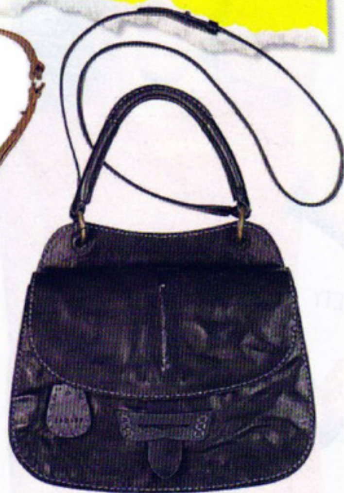
Radley London "Horse Guards" leather bag, 9.8"H x 11.4"W x 2.6"D. $325; 978-394-2342